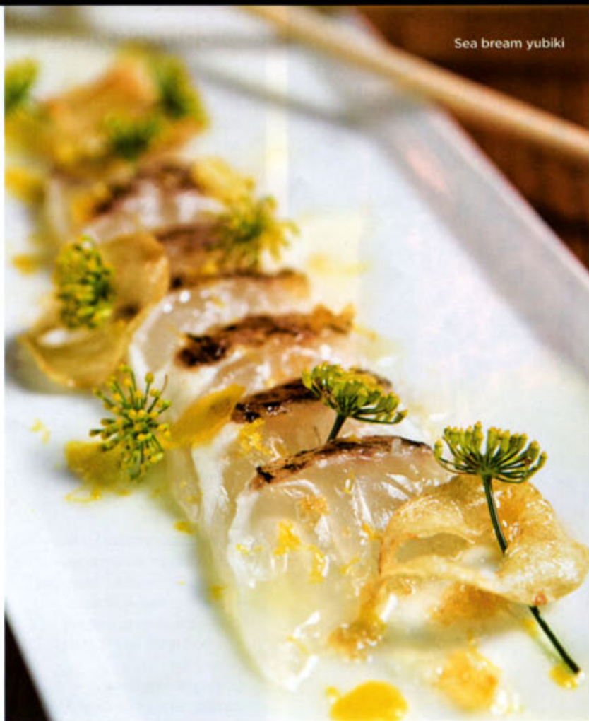
Sea bream yubiki