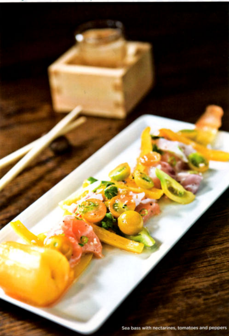
Sea bass with nectarines, tomatoes and peppers