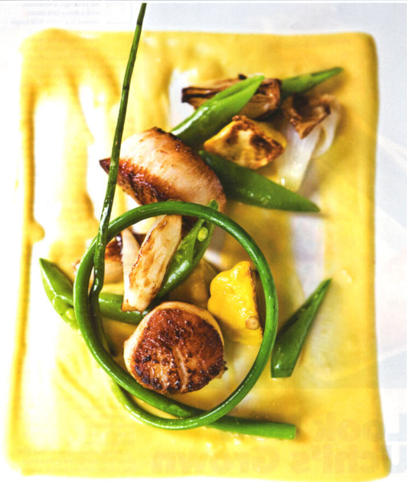
Seared scallops with sweet corn miso

Beyond the Menu / Restaurants / Food Spotlights