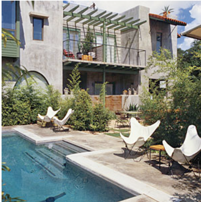
Hotel San Jose

Whether you've got a week or a weekend to spare, one travel editor picked her favorite spots to catch the spirit of Texas's coolest city.