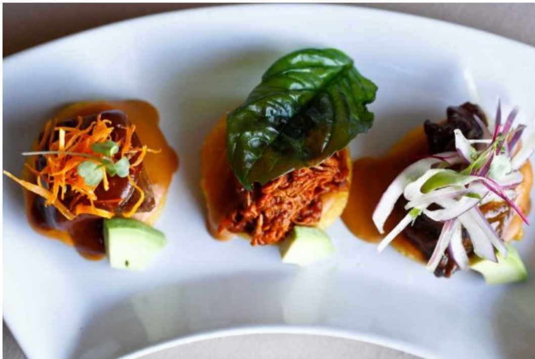
Arepitas, a traditional corn bread dough topped with three meats, is one of the offerings at Latin Bites Café.